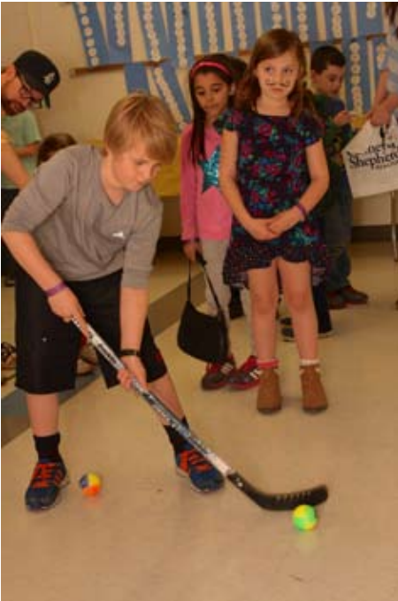
Games for all ages in 2014 included floor hockey to win great prizes.