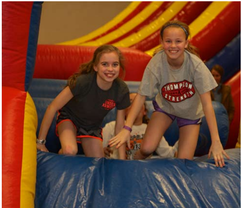
Fun and friendly competition creates a lot of smiles!