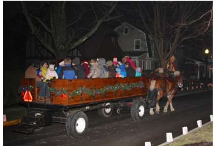
It was chilly, but the horse-drawn carriage ride was a big hit.