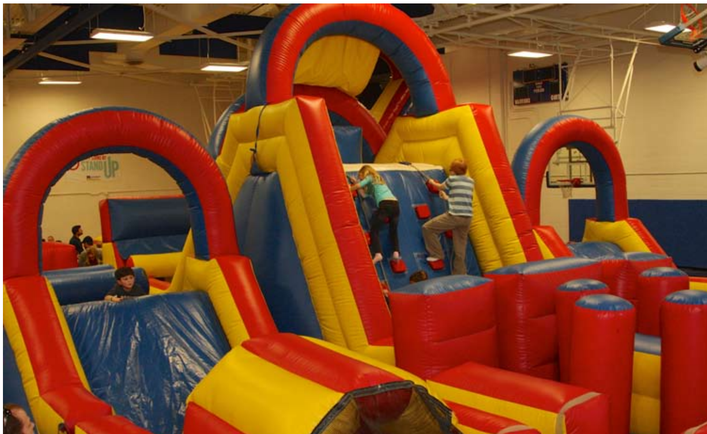
The inflatable obstacle course is a huge hit at the Mariemont Elementary Winter Carnival. This year's Carnival is Saturday, February 28th, from 4-7pm.

The 2015 Mariemont Elementary Winter Carnival is a guaranteed good time that your family won't want to miss! It's the perfect opportunity to get out of the house for a fun-filled unforgettable night!