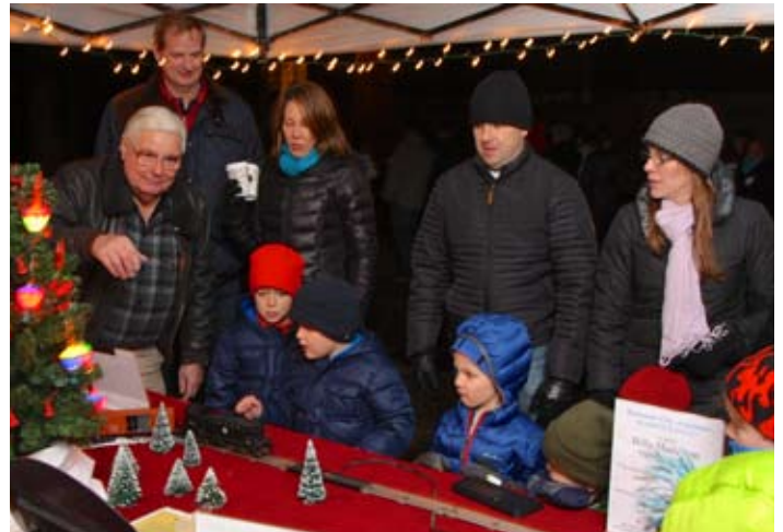
A model train set draws the attention of several future engineers.