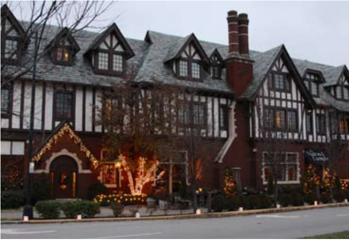
The Mariemont Inn and the National Exemplar dress up for Luminaria and the tree lighting.