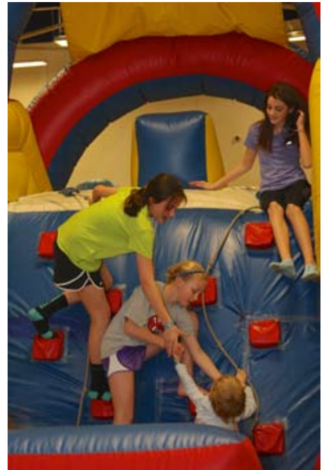
A young carnival-goer gets a helping hand through the obstacle course.