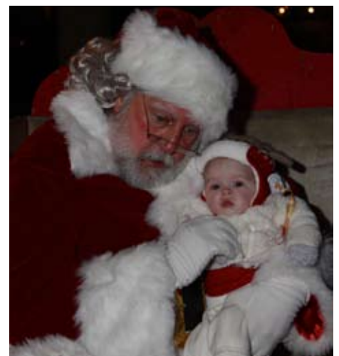
Santa greets one of his newest fans.