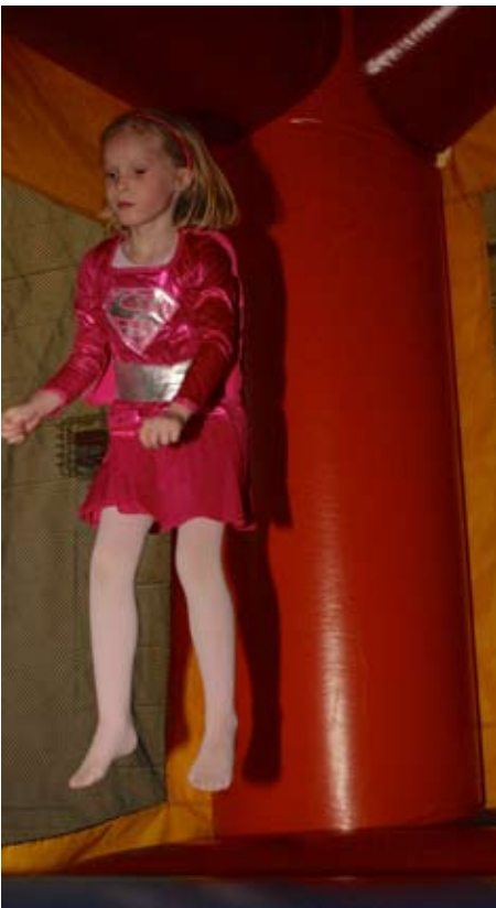
The bounce house is always a fan favorite.