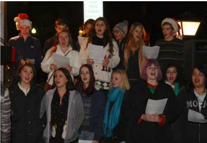
The carolers entertained an enthusiastic crowd.