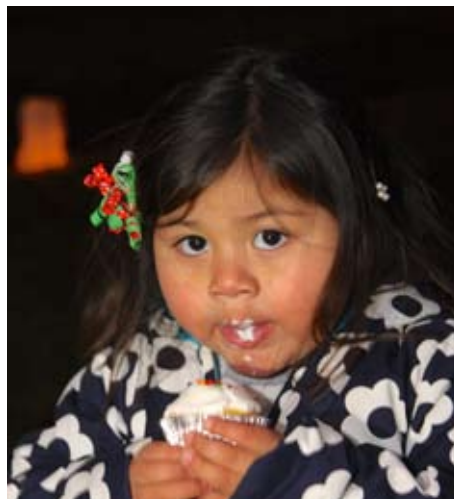
Cupcakes make for a sweet holiday treat.