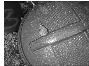
A lid with holes or cracks does not meet the requirement of a tight-fitting lid.

Items such as car batteries, used oil, unused gasoline or other fuels, oil-based paint, (Latex paint will be picked up if it has been allowed to dry out/solidify), paint thinners, pool chemicals, etc., are considered to be Household Hazardous Waste and cannot be picked up by Rumpke or the Maintenance Department. For a complete list of Household Hazardous Waste and/or for information about disposal of such materials, call the Hamilton County Solid Waste Management District at 946-7734 or 946-7777.